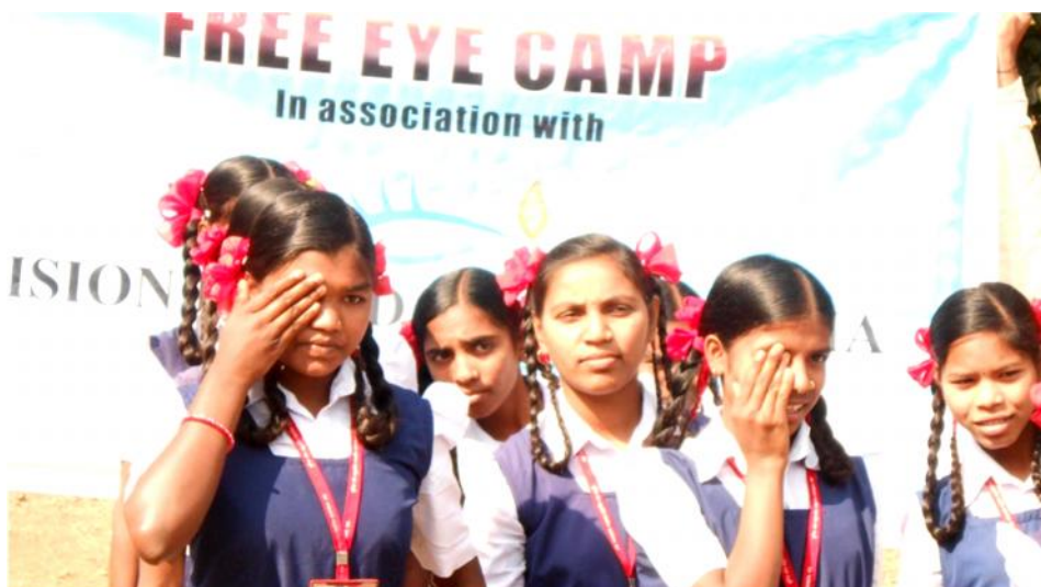
School Children undergoing Vision Test

Children in the school going age (6-14 years) represent over 25% of the population. Avoidable blindness in children is more important considering the number of potentially productive years that lies in front of the child.