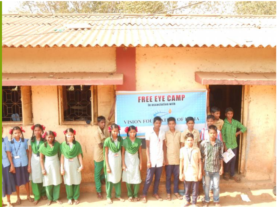
Children undergoing detailed examination

Step 2: Children, who could not read the chart correctly (vision found to be < 6/6 ) were sent to the Optometrist for detailed refraction