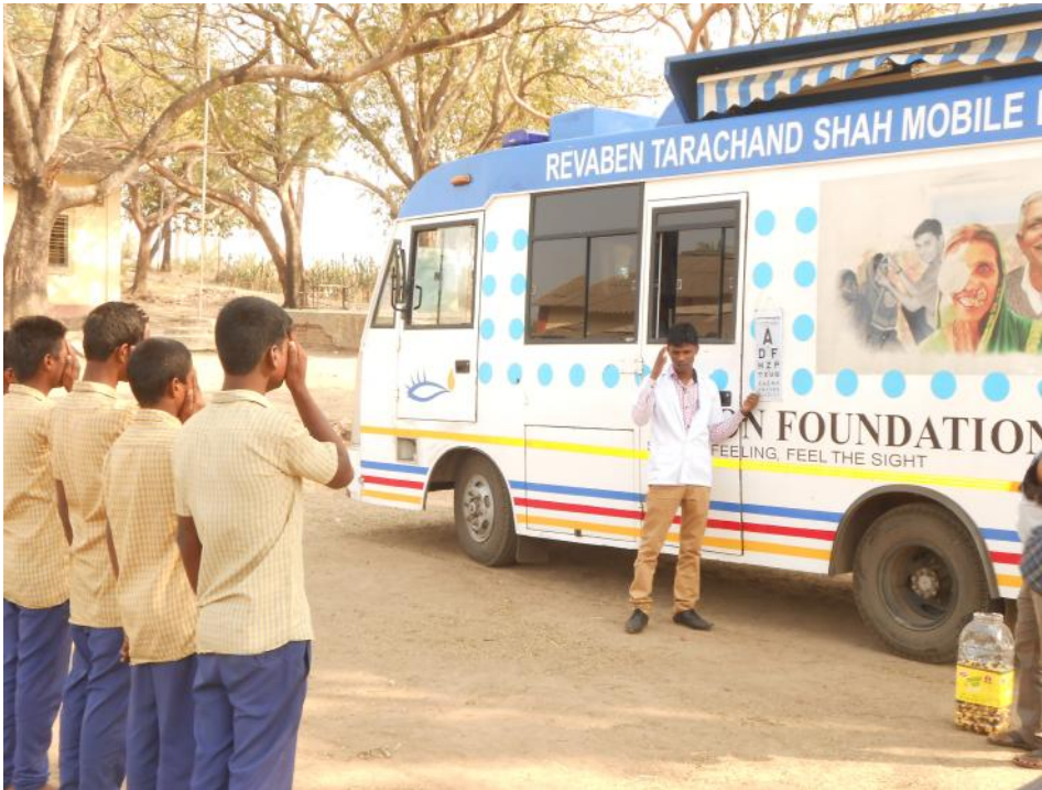
Vision Test of School Children